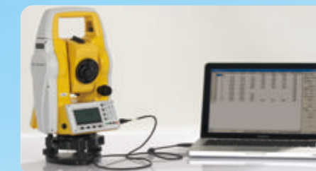
Data Transfer Software